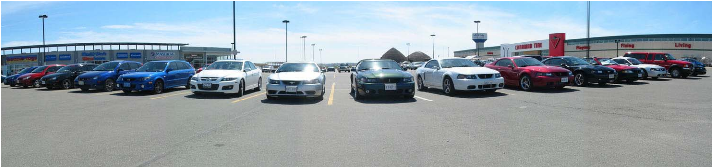
Top: SVTOA-Toronto members parked outside Montana's after our Spring Cruise from Acton to Milton.

A lot has happened since our last newsletter. Here is just a sample of the events that have taken place: